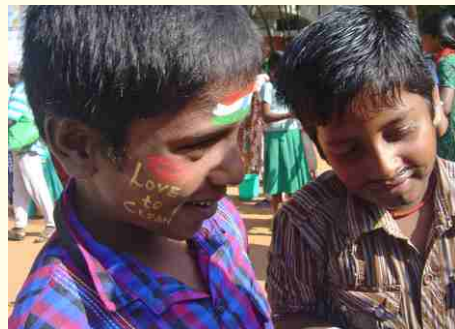
I Love to Clean