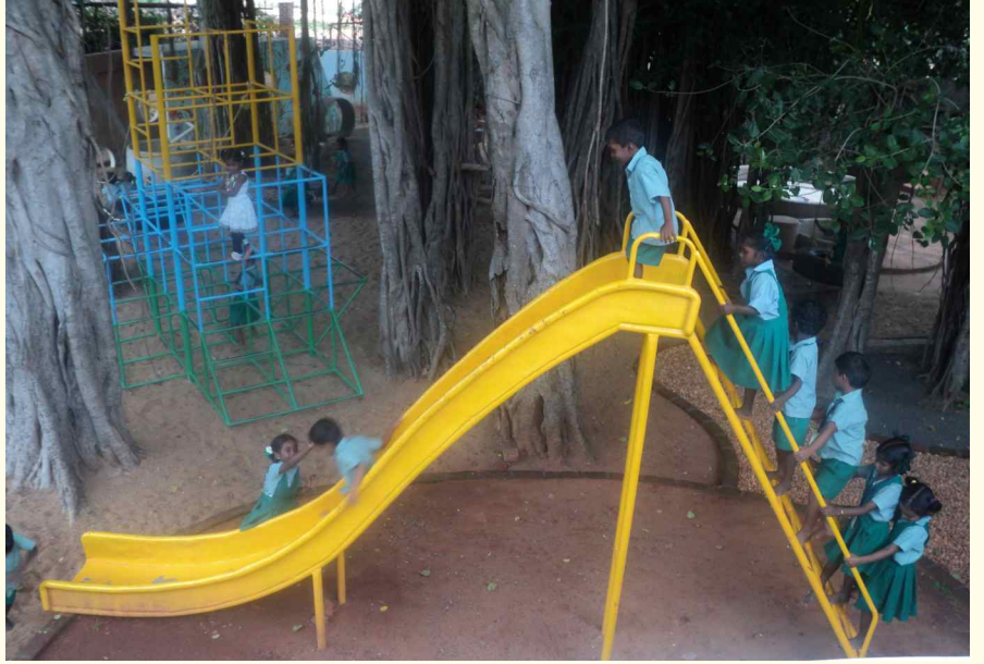
"The children love the new big, yellow slide"

This year we reopened the school 2 weeks earlier than normal in order to be closer to the schedule of other Auroville outreach schools. Certainly we see the impact on happy parents' faces. And the children, with a gleam in their eyes, walk out of the school office with new text books, notebooks and stationery; they are busy covering their new books and writing their names on them. Some children enjoy smelling their new books. We could see two sets of parents: the happy ones who managed to approach the crèche teacher in time to get places for their kids, and parents who regret that they came too late and found that the classroom was full so they can not place their child in Aikiyam. Yes, Aikiyam is full and our total strength is 252 children this year. We are supporting 126 girls and 126 boys.