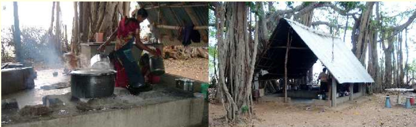
The temporary make-shift cooking arrangement under the Banyan trees.