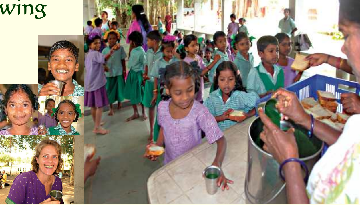
Growing strong with fresh spirulina drinks, - and green...!

As you may notice, the school is steadily growing, in more ways than one. We are grateful for the regular basic funding and donations in kind, which we receive from Auroville, and the Indian Government via SAIIER, - and especially to all of you, who continue supporting us during this time of global economic down-turn.