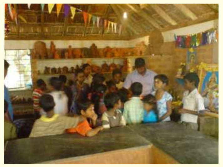
Colourful pooja to celebrate 20 years of the NCBS clay workshop

Although it doesn't exactly fall under the vocational training programmes, the school does have a real clay workshop complete with kiln. Twenty years ago, a lady from Germany provided the school with the funds needed to build a small building for this, and since then the students have been using it, at times with amazing results. In the month of January '09 the school organised a celebration and clay contest to which students of other educational facilities also had been invited. It was a joyful day, commemorating the 20 years of this small, but very much appreciated facility, and heartfelt love and thanks go out to the donor friend, who is still in touch with us today.