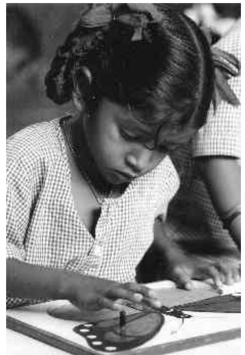
- finding the missing piece -