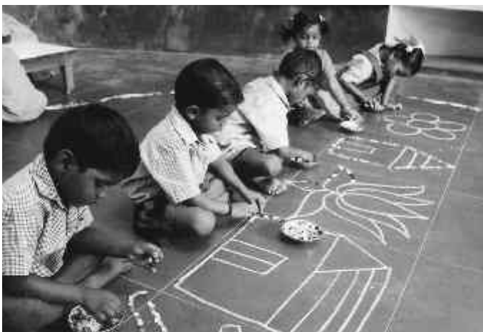
- learning to be still and concentrated, making beautiful shapes -

Colours in Tamil Nadu can be bright and fierce and strong, and so can the sounds. Our students live in villages where houses and huts are closely huddled together, constantly surrounded by all kinds of noise. Those of you who have been here may nostalgically remember the temple music amplified by loudspeakers, sounds of radio ditties from tea shops, loud TVs playing in every hut, the incessant barking of dogs, persistent cawing of crows, and the loud and animated manner of speaking on cell phones and otherwise. There are, of course, also sometimes the heated sounds of dispute, or of laughter or domestic squabbles between neighbours, and so on.